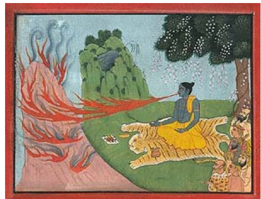
SHIVA BURNING A MOUNTAIN