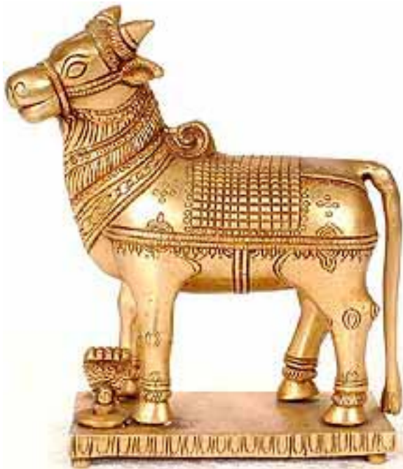
NANDI WITH THE SERPENT PROTECTING THE SHIVA LINGA

A Kamandalu or water pot is usually shown as placed on the ground to where Shiva is shown as sitting in meditation. This Kamandalu is supposed to be made from a dry pumpkin and contains nectar. The importance of tearing oneself away from egoistic desires and cleaning one's spiritual self is elucidated by the process of making a Kamandalu in which a ripe pumpkin's fruit is removed and the shell is cleaned and later dried.