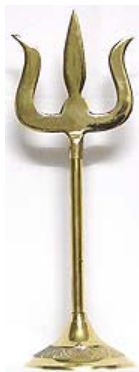
TRIDENT OF SHIVA

He holds the Trisul (trident) in his right hand and rules the universe by destroying evil with it. The three spikes of the Trishul represent the three Gunas (qualities) - Satva (mercy), Rajas (passion or desire) and Tamas (darkness and wrath). These qualities are said to be illusory in nature and since Shiva is the master of Maya (illusion) he is able to control these qualities thus becoming the master of the entire cosmos. As Mahakala - the eternal Time - he controls the three aspects of time - also represented by the three spikes - the past, present and the future. The trident also represents the three ways to union with the Supreme Being - Gyana (knowledge), Karma (action) and Bhakti (devotion).