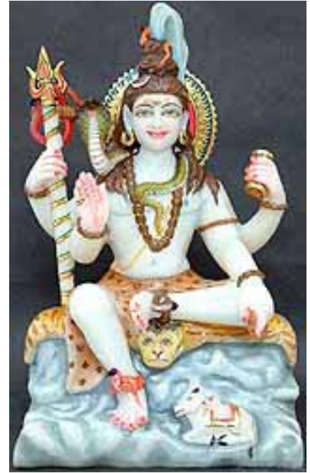
FOUR ARMED SHIVA

In his left hand he holds the Damaru (musical drum), which represents the primeval syllable Om. Shiva created the Sanskrit language and the grammar of music from the sound of the Damaru. The sound of the damaru is symbolic of the rhythm that is inherent in all of creation. Often Shiva is depicted with four hands, instead of two, with the other two being in the Abhaya (protection) and Varada (granting of boons) postures. Other objects associated with Shiva are the Parasu (battle axe), Aksamala (rosary), Pasa (noose), Khatvanga (magical staff) and Khadaga (sword)..