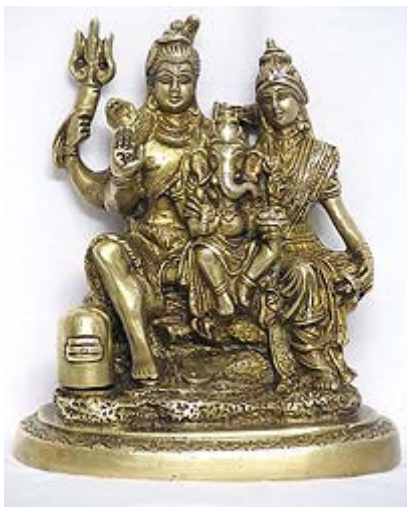
SHIVA WITH PARVATI AND GANESHA

Shiva is often propitiated by unmarried Hindu girls because of his unsurpassed qualities of love and generosity. He is considered an ideal husband in spite of his being an ascetic and is worshipped in the hope of having a husband with his ideal characteristics. He is seen as being a devoted husband to Parvati and a loving father to his sons Ganesha and Kartikeya and is often represented in art as a part of a close knit family.