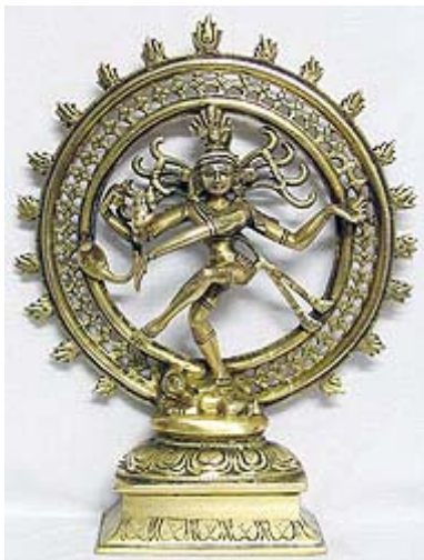
NATARAJA - THE KING OF DANCERS

Hindu males in India belonging to the caste of Brahmans have to undergo an initiation ceremony where the person has to perform certain rituals and eventually wear a sacred thread on one's body. The Lingayats comprise a sect of Brahmans in south India, who are followers of Shiva. Lingayats replace the sacred thread with a necklace of small Lingas. It is said that the sexual nature of the Linga has been over-interpreted and over-publicized by western scholars. The Linga is meant to be a symbol and the Shiva-Purana defines the Linga as symbol for realizing the nature of the object that the symbol represents - a shape given to the shapeless so as to elucidate the nature of the shapeless. It says that it is the owner of the Linga - the Progenitor, the Supreme Creator - who is worshipped and not the Linga itself. The Linga merely leads one to Shiva.