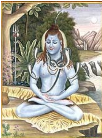
SHIVA SITTING IN PADMASANA

Shiva is usually depicted as sitting in meditation in Padmasana - a popular yogic posture. This is in consonance of his status of an ascetic yogi. However another popular depiction, as described earlier too, is that of Nataraja - in the Tandava dance posture. He is shown wearing a tiger skin around his waist - and sometimes also partially covering his upper body.