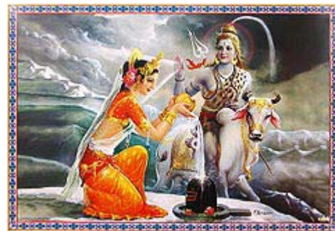
PARVATI PINES AND PRAYS FOR LORD SHIVA

Shiva is one of the most popular of deities in India - accessible to all - irrespective of caste. Usually access to most deities have been historically limited to the highest caste of Brahmins but in the case of Shiva, even those who belong to the lowest of castes have been allowed to touch the image of Shiva and personally offer their prayers to him. There is an interesting tale related to the devotion of a lower caste hunter towards Shiva. It is said that Kannappa - a low caste tribal hunter, was an ardent devotee of Shiva. He was not indoctrinated with the formalized rituals practiced during the offering of prayers to Hindu deities. He used to offer food to the deity