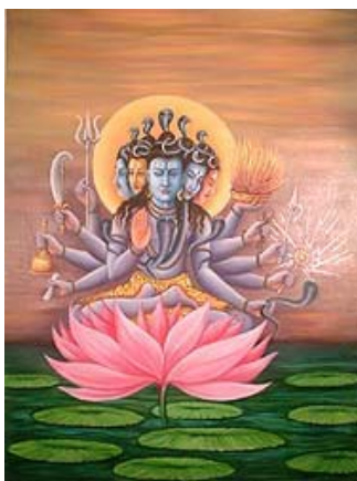
SHIVA WITH FIVE FACES

Lord Shiva, when symbolized in human form is depicted with a body white in color, signifying purity and his linkage to snowy mountains. Shiva is often attributed with five faces, each representing one of his five cosmic tasks of creation, establishment, destruction, oblivion, and grace. The five faces are also linked to the primeval Hindu symbol of Om. Four of the five faces are shown looking in the four directions while the fifth is shown looking upward. The face looking towards the north is white in color and is called Sadyojat (or instantly born). The red face looking towards the west is called Vamadeva (Vama signifies the left side and Deva means god) and symbolizes the ego. The face looking towards the south is called Aghora (or that which is void of darkness), is blue or blue-black and symbolizes the intellect. Tatpuruasha (or the supreme being) is the face looking towards the east and is yellow in color. It represents the form of nature manifested on earth. Finally, the face looking upward is named