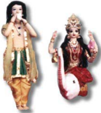
BHAGIRATH ESCORTING GANGA TO EARTH

There is another interesting tale which tells us about the origins of his name Gangadhar. Legend says that the sixty thousand sons of King Sagar wrongly plundered the hermitage of sage Kapil. The sage, in his anger, cursed the king's sons and burnt them to ashes. The only way that they could be restored to life was if the sacred river Ganga would come down from heaven to wash over their ashes. The king's grandson's grandson - Bhagirath - through severe austerities, propitiated the river Ganga to come down to wash over his ancestors' ashes, which Ganga agreed to.