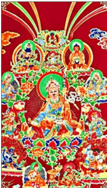
Buy this Wall Hanging