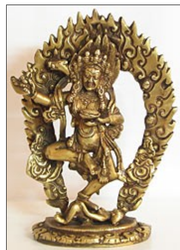
Buy this Sculpture

Deity yoga is vital to Vajrayana practice. Here, practitioners visualize themselves as the meditation Buddha or Yidam. The purpose of this idol worship is to make the follower understand the concept of non-duality.