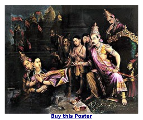
SITA BEING TAKEN AWAY BY MOTHER EARTH

Sita requests Bhoomidevi to have mercy on her and give her release from this unjust world and a sadness-filled life. The earth suddenly and dramatically splits open and Bhoomidevi appears from inside. She takes Sita by the hand