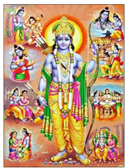
Buy this Poster