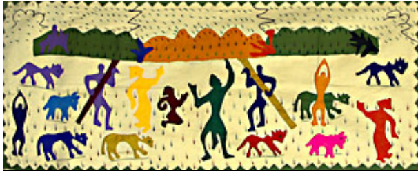
KRISHNA LEFTS GIRI GOVARDHANA

The whole world knows about the Krishna Avatar, His mission and His actions during the course of His Incarnation. But who was this Krishna really? When we think of Krishna, the first thing that comes to our minds is that mischievous little toddler who tormented, yet pleased Yashoda and the other Gopis with his unending pranks.