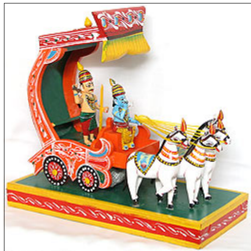
KRISHNA AND ARJUNA IN THE KURUKSHETRA BATTLEFIELD

On seeing his own family, the legendary Bhishma Pitaamah and his Guru, Acharya Drona on the other