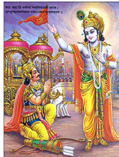
KRISHNA PREACHING GITA TO ARJUNA DURING THE KURUKSHETRA WAR

Kaayena Manasaa Buddhyaa Keyvalair Indriyair Api Yoginaah Karma Kurvanti Sangam Tyaktvaatma Suddhayey