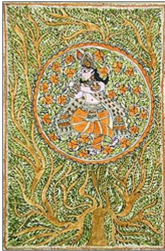
KRISHNA - THE CENTER OF THE COSMIC TREE

and 'wrong'. He does not impose any rigid 'do's' and 'don'ts' either. Krishna's message of the Bhagavad Gita teaches man to free himself of his fetters, while being very much in Samsara, realize the actual nature of his Self and go beyond the human limitations of sorrow, ageing and death.