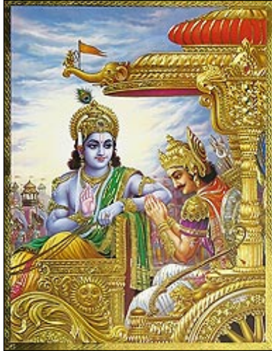
KRISHNA PREACHES THE GITA

In an age when spirituality is steadily on the decline on a global scale and materialism rules the roost, most people in the present scenario doubt the efficacy of teachings such as the Bhagavad Gita.