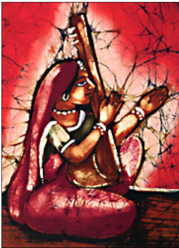
MIRABAI - THE ETERNAL SYMBOL OF BHAKTI

Sanniyamyendriya Graamam Sarvatra Sama Buddhayah Tey Praapnuvanti Maameyva Sarvabhootahitey Rataah"