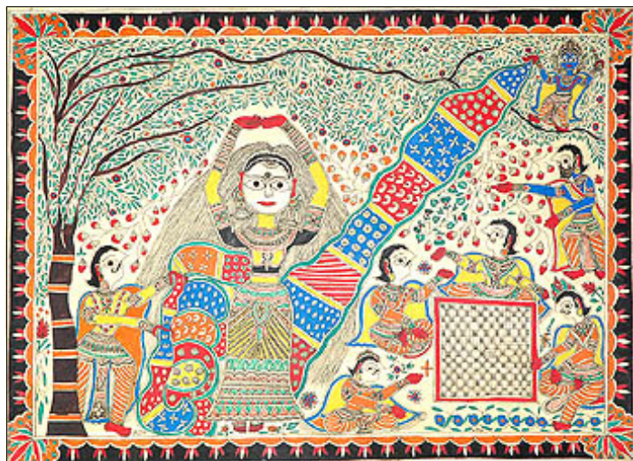
KRISHNA SAVES DRAUPADI

A distraught Panchali begged and pleaded with her husbands, Dhritarashtra and all other dignitaries present at the venue, but none could speak to save her dignity. She finally beseeched her friend and savior, Sri Krishna, to protect her. When Dusshasan attempted to