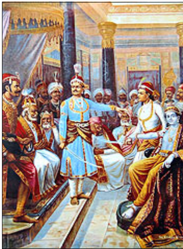
SRI KRISHNA, IN HIS ROLE AS AN ENVOY OF PANDAVAS TO THE KAURAVA COURT

According to the rules of the game of dice, the Pandava brothers were to go for exile for a stipulated period, after which, Duryodhan promised, they would get back their kingdom. But when they got back from exile, they were refused even an inch of land. Lord Krishna tried his level best to discuss and bring about an amicable situation, but none seemed to present itself on the horizon.