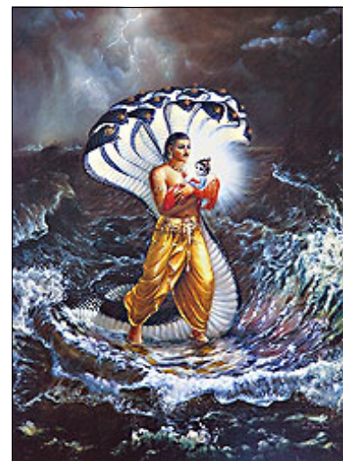
VASUDEVA CARRIES NEW BORN KRISHNA TO GOKUL

Krishna's birth, according to historians, took place on the midnight of the 8th day after the New Moon, in the month of Sraavana. The English date is given to be July 19th, in the year 3228 B.C. The Krishna Avatar is said to have lasted about 125 years, after which He left this mortal world on the 18th of February, 3102 B.C., on the New Moon night of Phalguna.