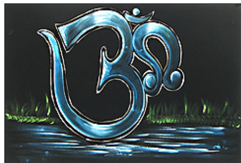
OM - DHYANA YOGA

Krishna also gives an additional yoga, namely, Dhyana Yoga, as an ideal path towards enlightenment. He speaks of applying several tenets and techniques of meditation in order to achieve complete control of the mind and body, thereby realizing the true nature of the Brahman dwelling within oneself. A similar method of meditation was later expounded by Patanjali in his Yoga Sutras.