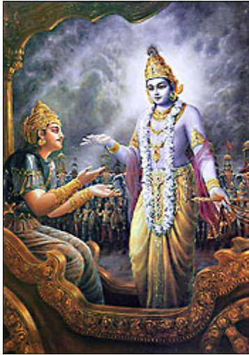
KRISHNA PREACHING THE GITA TO ARJUNA

"Paarthaaya Pratibodhitaam Bhagavataa Naaraayaneyna Swayam Vyaasena Grathitaam Puraana Muninaa Madhyemahaabhaaratam Advaitaamritavarshineem Bhagavateem Ashtaadashaadhyayaneem Amba Tvaamanishandadhaami Bhagavadgeetey Bhavadveyshineem"