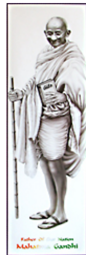
MAHATMA GANDHI AND THE GITA