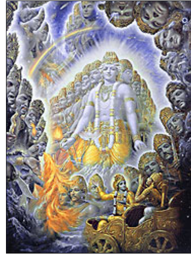
KRISHNA SHOWING THE VISHWAROOPA

Krishna takes a Vishwaroopa (massive avatar) and reveals Himself as but one aspect of the Supreme Mahavishnu. He shows him the cycle of life and how souls live and die and pass through the various stages between the process, while in this mortal world.