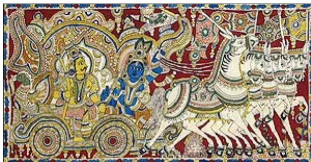
KRISHNA EXPOUNDS THE GITA TO ARJUNA

The various Yogas that Krishna propounds in the Bhagavad Gita truly captures the essence of life itself.