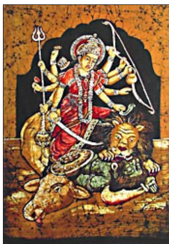
Buy this painting