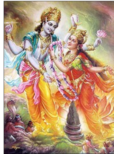
Buy this poster

LAKSHMI MARRIED VISHNU AT THE TIME OF SAMUDRA MANTHAN